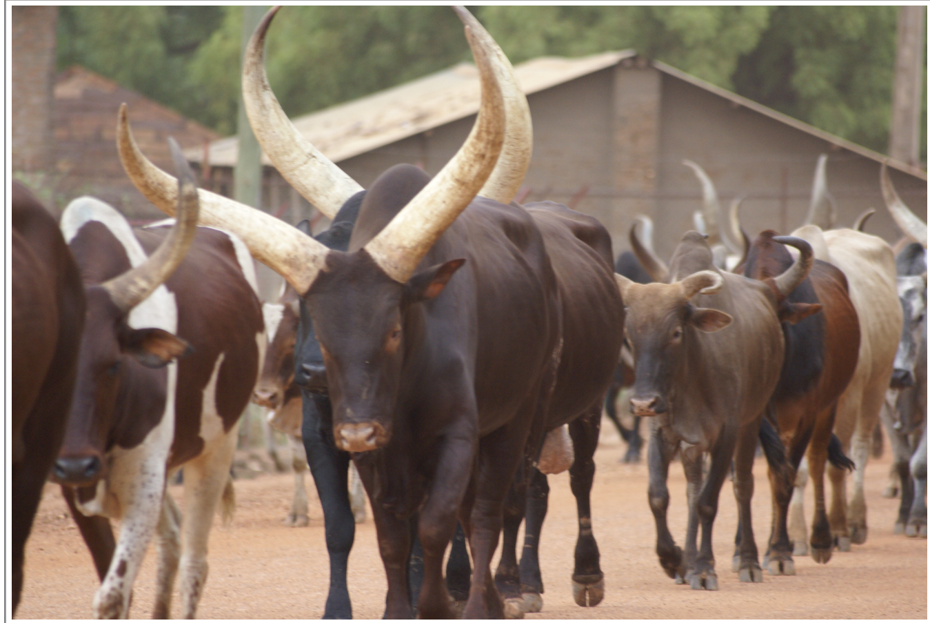
Fig 6, cows walking through a village